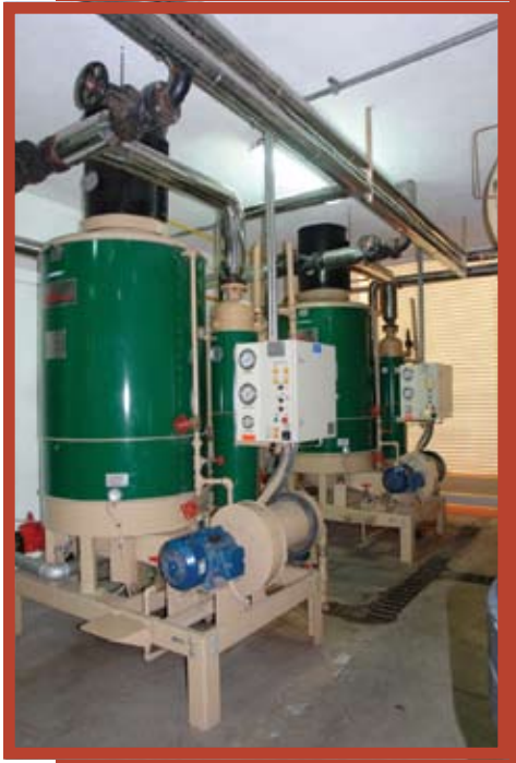
In the boiler room of Nicro Bolta, Puebla, Mexico, the new system incorporates two, 185 BHP steam generators, a 5,000-liter tank with heat exchanger to deliver 230°F (110°C) water, and a speed-controlled pumping system that ensures proper pressure at discharge points.

With these needs in mind, the company approached Clayton de Mexico S.A. de C.V. to request a proposal for a turnkey steam and hot water system that would meet its precise